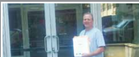
Good & Welfare