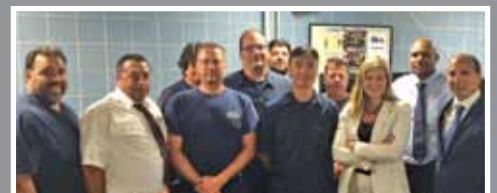
7 Queens North Transfer Station