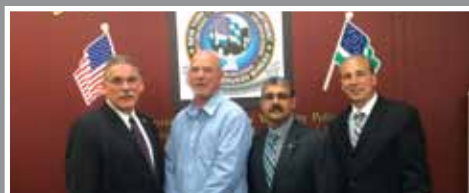
4-5 Longevity Awards