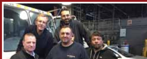
4 Front Lines of Snow Equipment