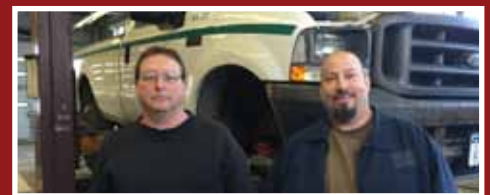
6 DEP Ashokan Visit