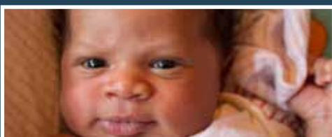
About Our Members