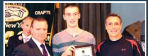
Komnick Scholarship Winner