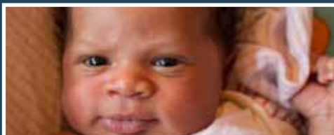
About Our Members