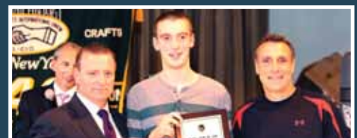
Komnick Scholarship Winner